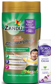
450 gm Rs. 195/-