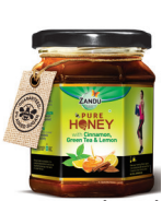
250 gm (VAH) Rs. 190/-