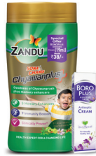
225 gm Rs. 99/-