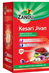
450 gm Rs. 420/-