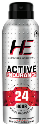
150 ml Rs. 199/-