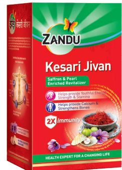
900 gm Rs. 740/-