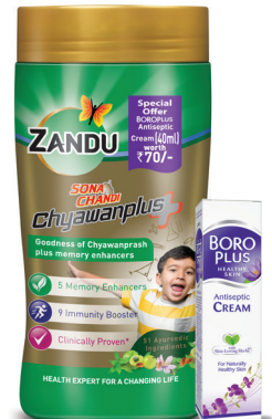
900 gm Rs. 349/-